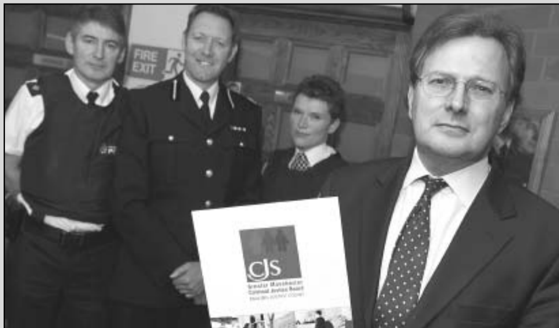
At Minshull Street Crown Court in Manchester: Attorney General Lord Goldsmith with ACC Rob Taylor, Insp Gail Spruce and Insp Cliff Bacon.

"Greater Manchester is often chosen for piloting national projects as we have an excellent multi-agency approach to criminal justice and holding offenders to account."