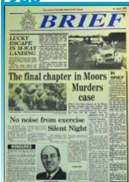
The renewed search for bodies buried on Saddleworth Moor by Ian Brady and Myra Hindley.