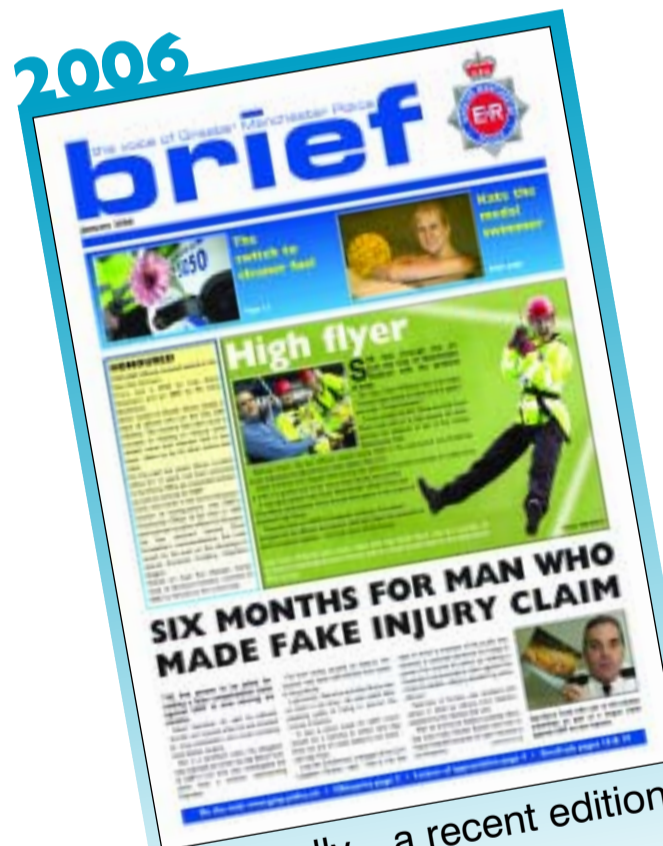
And finally... a recent edition.