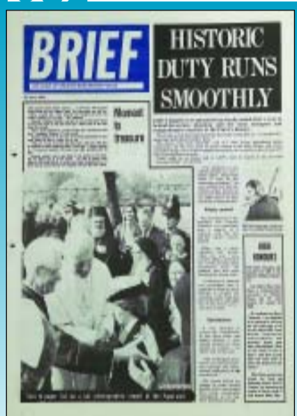
The Pope's visit to Manchester.