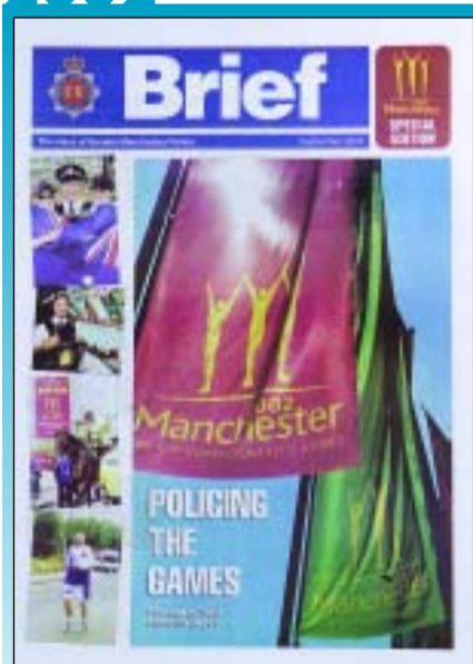
A special edition after the successful policing of the Commonwealth Games.