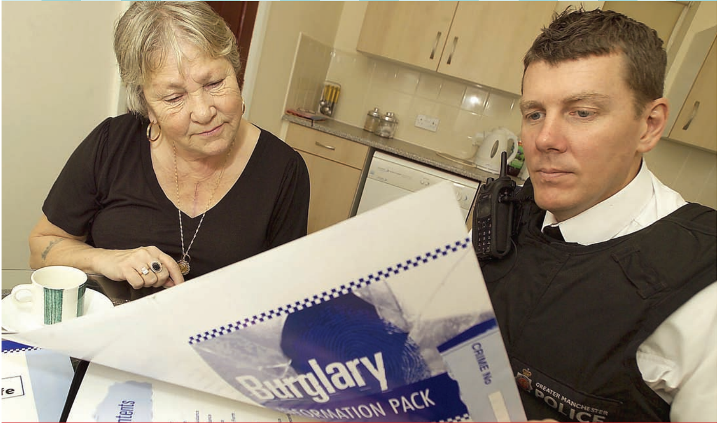
Local officer advises residents to follow simple crime prevention advice and protect their 'Heritage'